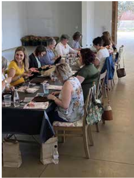
Previous event images